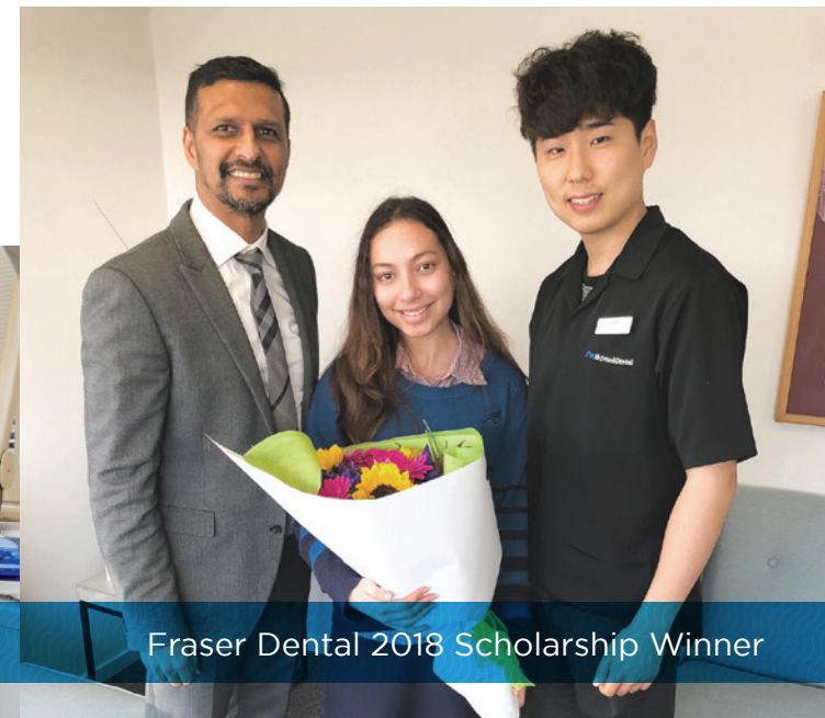
Fraser Dental 2018 Scholarship Winner